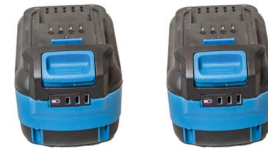
x 2 batteries B1840