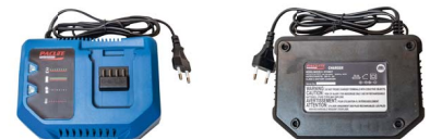
Battery charger C1860L

Transport case + 2 batteries + 1 battery charger